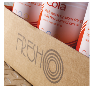
High quality text and graphics