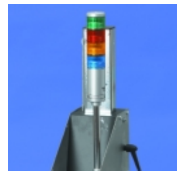
Beacon clearly indicates code read status