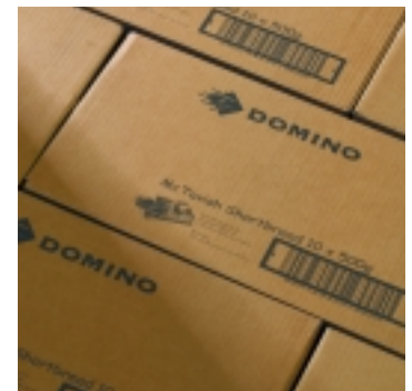
Reassurance of code quality