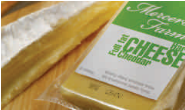
Wide variety of inks to suit modern packaging materials

The A-Series plus offers unrivalled reliability and connectivity, delivering a coding solution that provides increased production efficiencies by addressing the most common and important sources of manufacturing productivity loss.