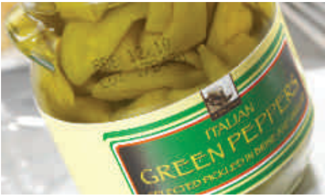
Print variable data for full traceability

A-Series plus networking capabilities allow remote monitoring without the need for special software.