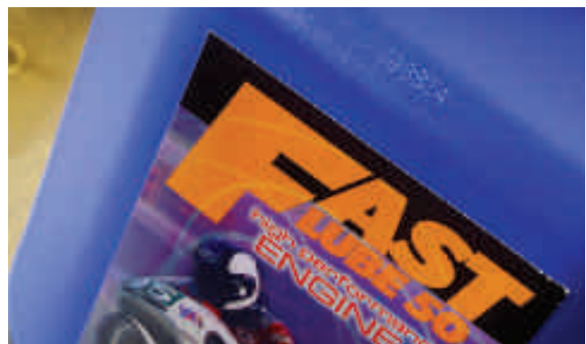
High contrast inks for dark surfaces