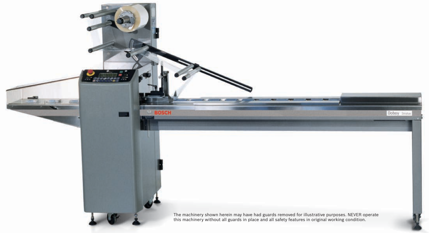
The machinery shown herein may have had guards removed for illustrative purposes. NEVER operate this machinery without all guards in place and all safety features in original working condition.

Quality package seals, tightness and appearance are easily achieved with two sets of finwheels in conjunction with the inclination roller. A "no-tool-required" handwheel for centering the end seal adds the final touch. Three independent servo motors for driving the infeed chain, film feed and end seal crimpers assure consistent control of product, package material and sealing. Also, the Stratus design eliminates drive chains, belts and variators. The result is less maintenance, less wear and greater consistency in machine operation and package quality.