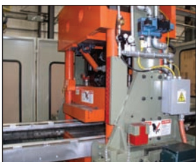
High Tonnage Trim Station