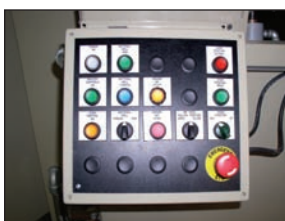
Easy Operator Controls