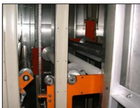
Variable Speed Rollers