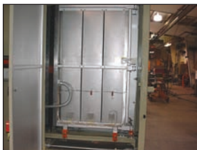
Roll Away Oven