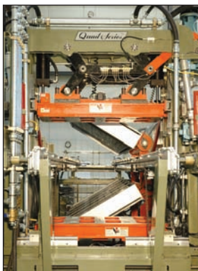
Shown with clamshell oven