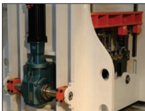
Symmetrical drive linkage