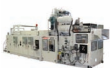
Tooling, Parts & Service