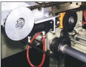
Splined Drive Shaft