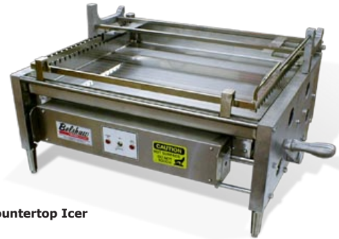
Belshaw HI-18C Countertop Icer

Heavy-duty construction and sound design facilitate cleaning and provide a durable product that will stand up to years of everyday use.