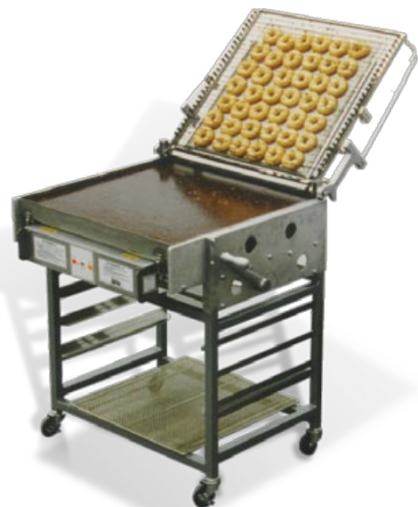
Belshaw HI-24F Floor Model Icer

BELSHAW BROTHERS, INC • 814 44th St NW, Suite 103, Auburn, WA 98001 • USA