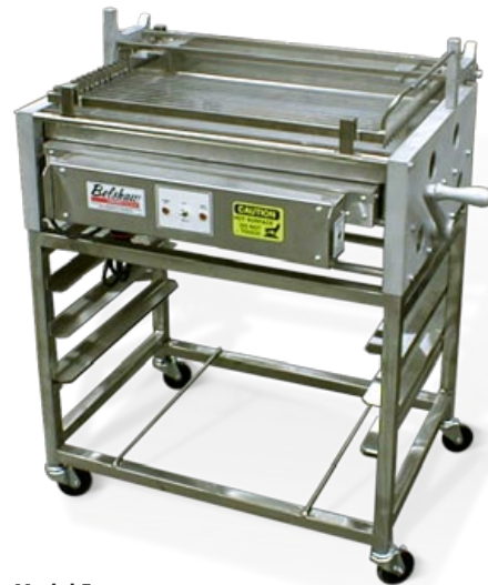
Belshaw HI-18F Floor Model Icer