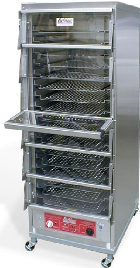
Belshaw EP18/24 Proofer

1 Capacity measured at a proofing time of 30 min.