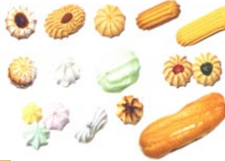
Sample of Omega cookies