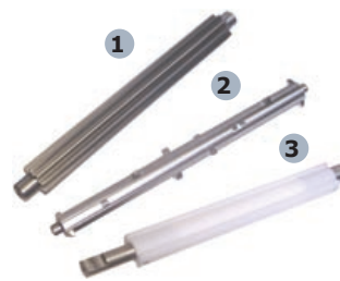
Gears: 1-Standard 2-Intermediate 3-Particulate