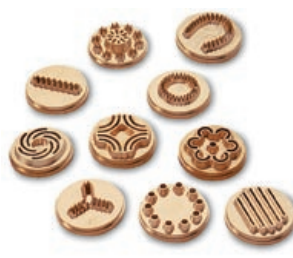
Italian cookie dies