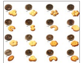
Huge variety of shapes + styles