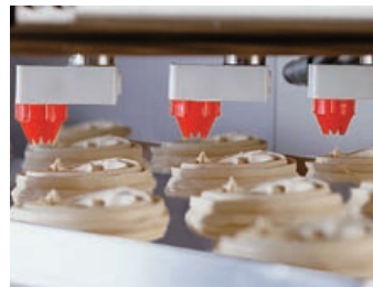
Omega nozzles making swirls