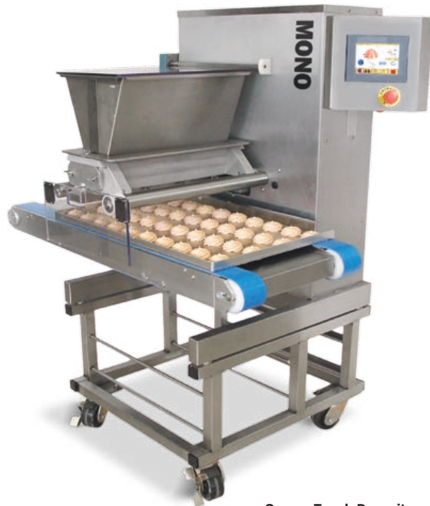
Omega Touch Depositor