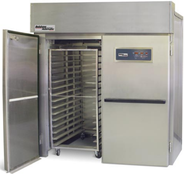
BARP-3-40 Retarder Proofer

*Racks may be snug at maximum capacity. For details of rack arrangement, see the Rack Capacity Guide at http://www.belshaw-adamatic.com/specs/belshaw-adamatic-rack-capacity-guide.pdf