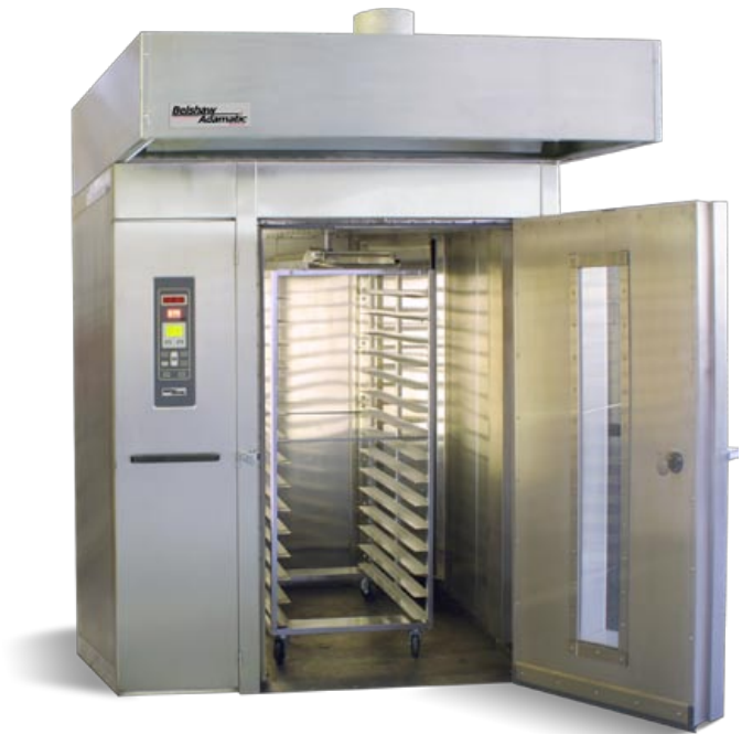
BARO-2G Rack Oven