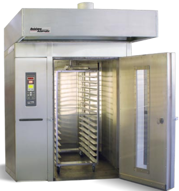
BARO-2G Rack Oven