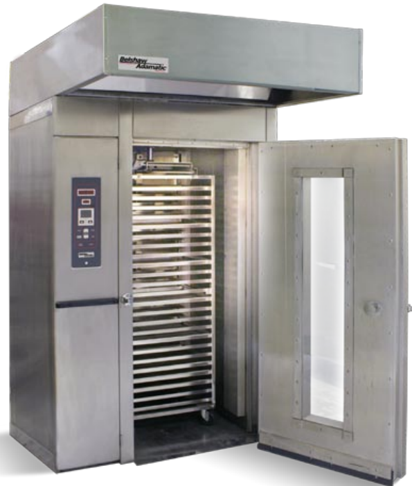
BARO-1G Rack Oven