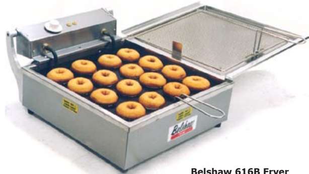
Belshaw 616B Fryer

Tempura makers find the Belshaw 616B's small size, shallow depth and overall simplicity ideal for tempura frying.