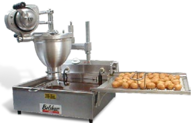
Belshaw 'Cut-N-Fry' for HushPuppy/Loukoumathes