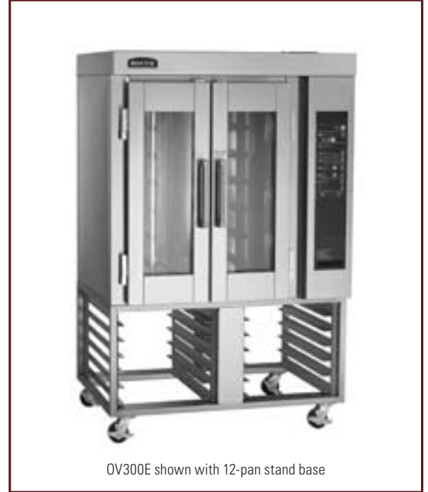
OV300E shown with 12-pan stand base

Note: Capacities based on a standard 18"x26" pan