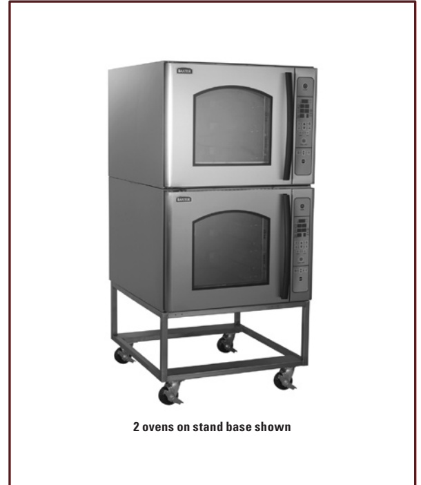
2 ovens on stand base shown