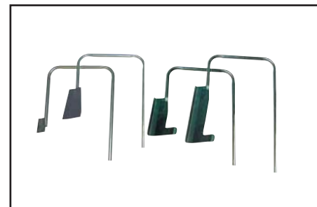
Quart, Gallon, 3.5 Gallon and 5 Gallon Blades

Maximum: 5 gal. or 25 liters Diameter: 14" (35cm)