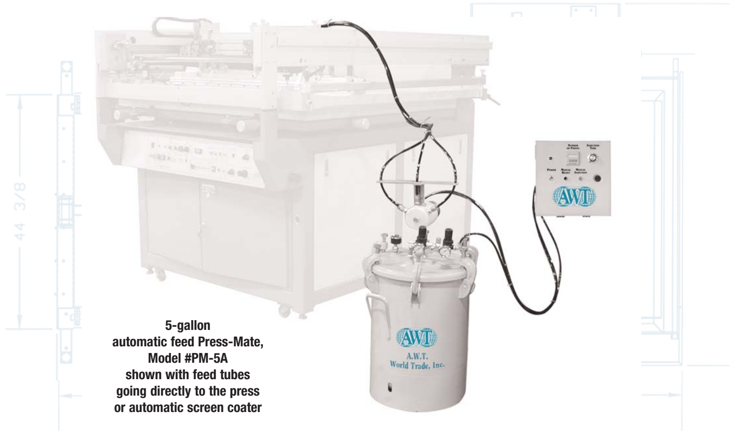
5-gallon automatic feed Press-Mate, Model #PM-5A shown with feed tubes going directly to the press or automatic screen coater