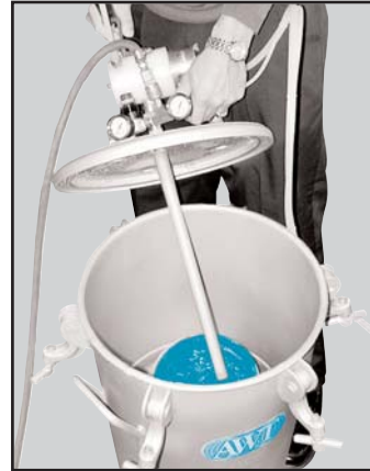
Operator never handles inks or emulsions, which are dispensed through feed tubes.