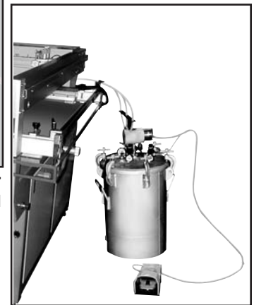
Press-Mate shown with foot pedal operation.