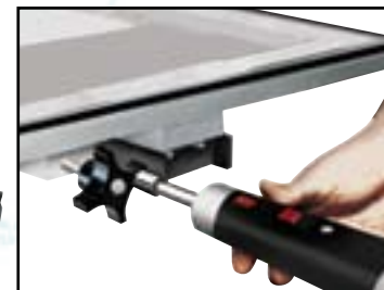
Tension Quick Knobs