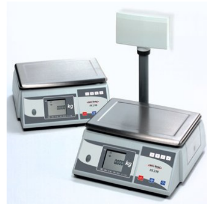
FX 210 weight only scale for general weighing applications.