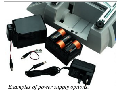
Examples of power supply options.