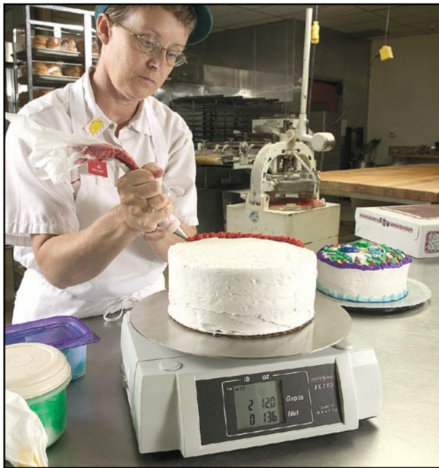
Rear LCD display.

*Subject to the quality of batteries used and FX 210 specification.