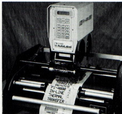
Optional AutoLabel™ PI-4000 programmable imprinter.