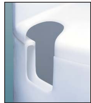
Inner tank dome overlaps outer tank to prevent contamination.