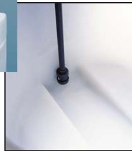
Molded in sump in the primary tank is located directly below the pump shelf. Suction lines can be lowered onto the sump area, which will allow for maximum drainage of chemical with top discharge assemblies.