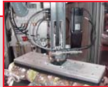
Rotary Servo Axis for Alternating Patterns