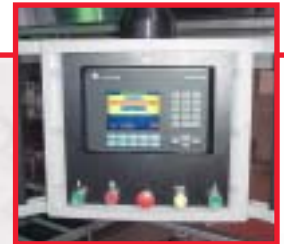
Simple Controls and Two Minute Changeovers