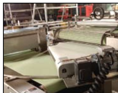
Retractable Dough Curve With UHMW Design