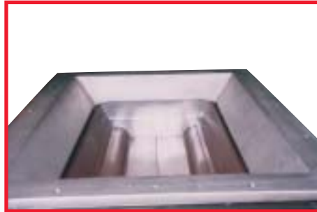
Teflon® coated rotary blades.