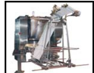
Optional Dough Elevator Showing Swing Away Feature