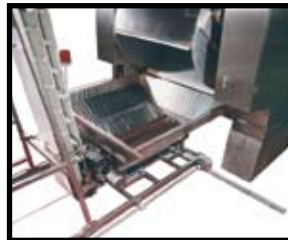
Optional Lateral Traveling System