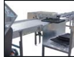
Discharge Conveyor with Tray Reject