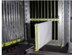
Polygonal Pocket Filters