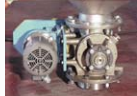
6" Diameter Heavy Duty Rotary Airlock