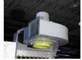
Heavy Duty Blower Fan