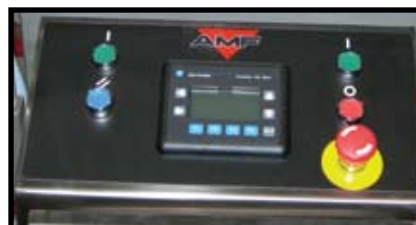
Optional Pump Mounted Station