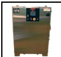
Remote Enclosure With Operator Controls