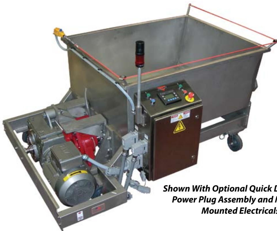
Shown With Optional Quick Disconnect Power Plug Assembly and Machine Mounted Electricals