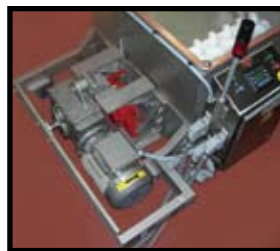
Direct Shaft Drive