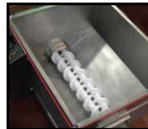
Twin Screw Auger Design