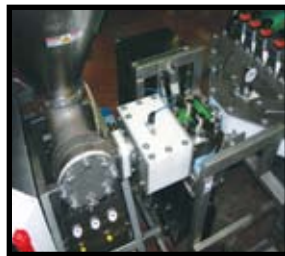
Hopper, Auger & Transition Block