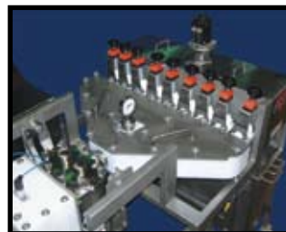
Metering Pump, Manifold, and Valves