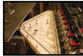
Quick Clean Manifold