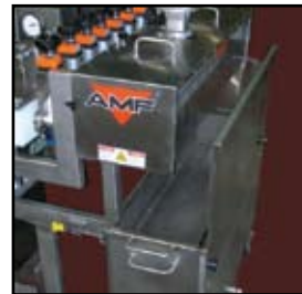
Pushback with Catch Pan