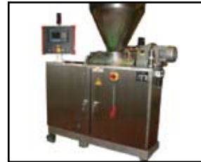
Machine Mounted Electrical Enclosure & Operator Controls