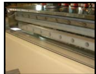
Servo Rotary Cut-off