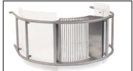
Stainless Steel Bowl Safety Guard