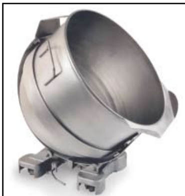
Stainless Steel Bowl and Dolly