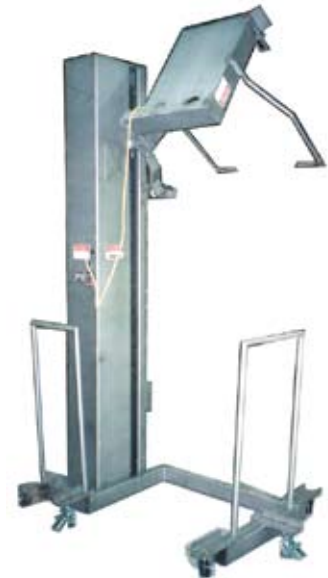
Optional Column Bowl Dumper