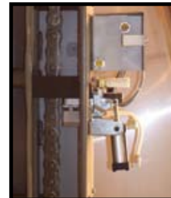
Safety Latch Engaged