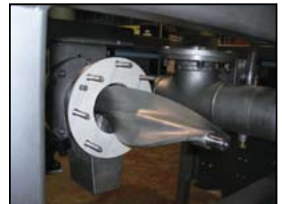
DoFlow Plus Developer Paddle