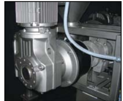
Direct Drive System