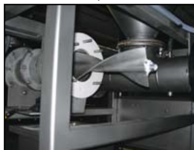
UltraFlow Developer Paddle