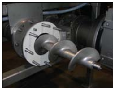
DoFlow Plus Feed Screw