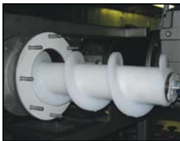
UltraFlow Feed Screw