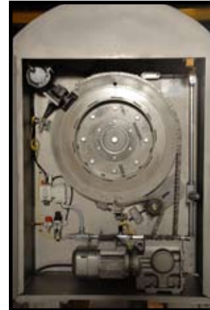
Mechanical Tilt Mechanism