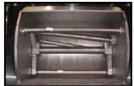
Optional Y-T Agitator