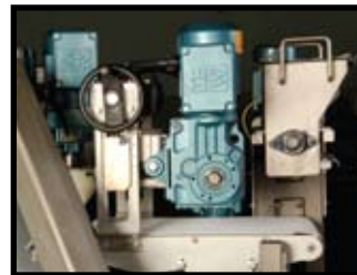
Optional AC Drive Kicker Roller, Discharge Conveyor & Flour Sifter