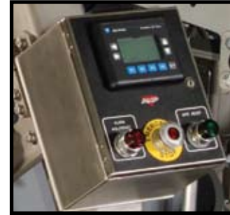
Machine Mounted Operator Control Station

NEMA 12 enclosure (painted steel) including: