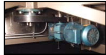
V Belt AC Cone Drive