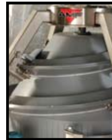
Non-Stick Coated Combination Cylindrical and Conical Rounding Surface with Adjustable Rounding Track