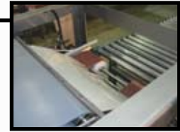
Package Transfer Slide to Basket Conveyor