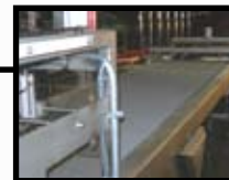
Optional Bridge Conveyor