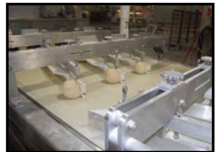
Grooved UHMW Rounder Bars