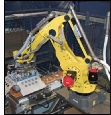
4-Axis Robot Arm