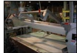
Hinged Rounder Bars with Gas Spring Assist