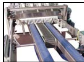
Magnetic Pan Indexer