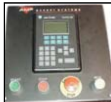
Operator Interface Panel