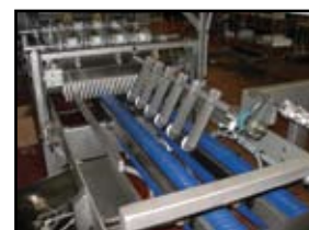
Rotary Pan Indexer