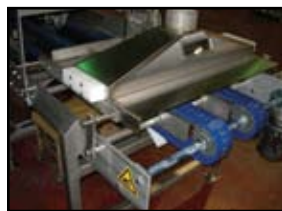
Pan Dust Collector