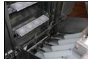
Pneumatic Flapper Gate Transfer