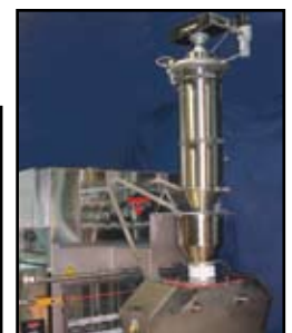
Zig-Zag Flour Reclaim System