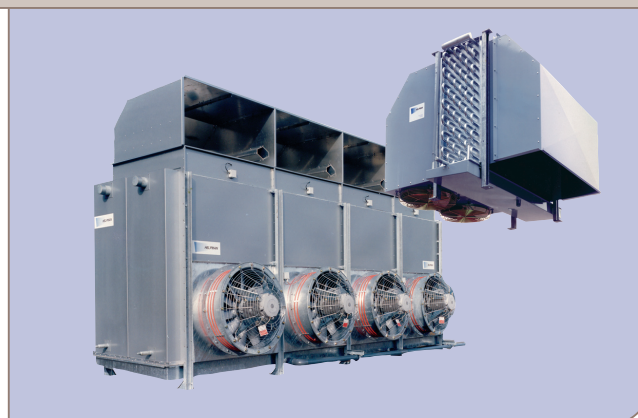
ZT/ZTY & TR/TRY