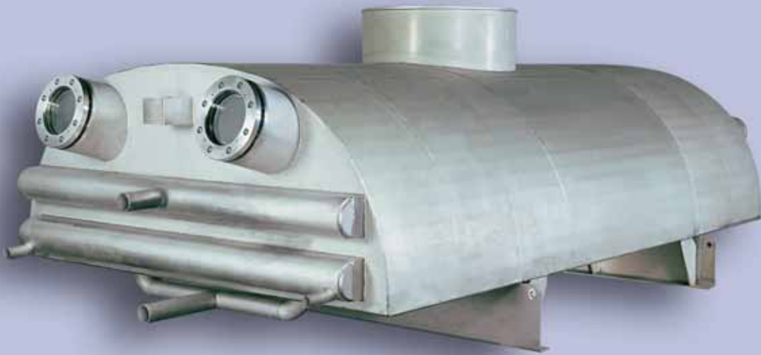
The VHE Final Heater

For deodorization and physical refining of fats and oils