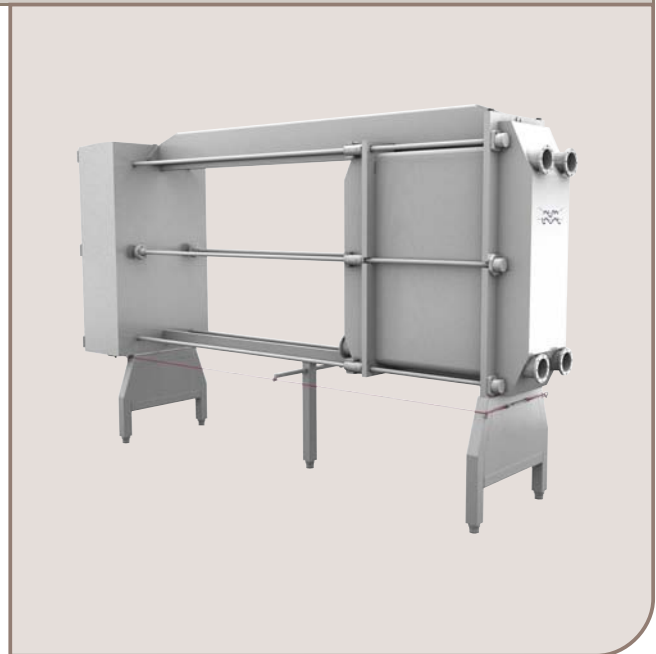
FrontLine™ 15 Automatic

The plates are fitted with a gasket which seals the inter-plate channel and directs the fluids into alternate channels. The number of plates is determined by the flow rate, physical properties of the fluids and the temperature program. Connections may be located in the frame plate, the pressure plate and the connection plate.