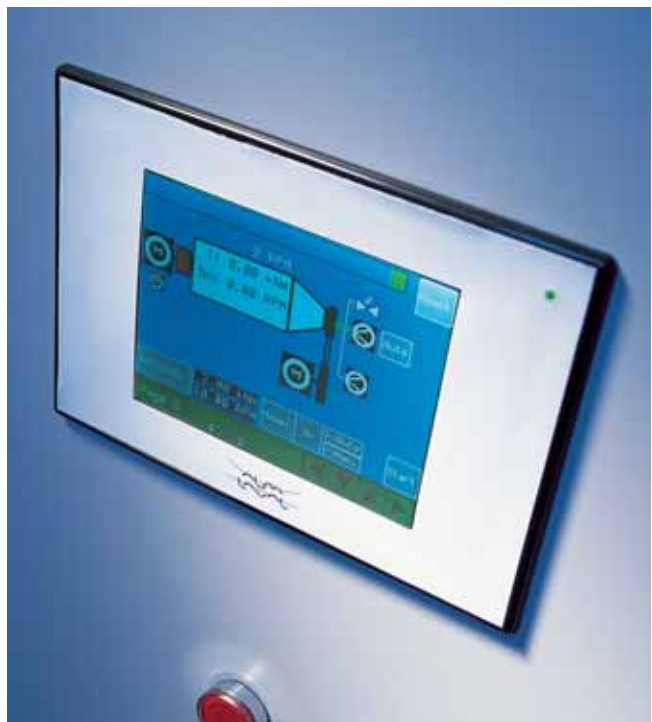
Screen for Decanter Core Controller (DCC)