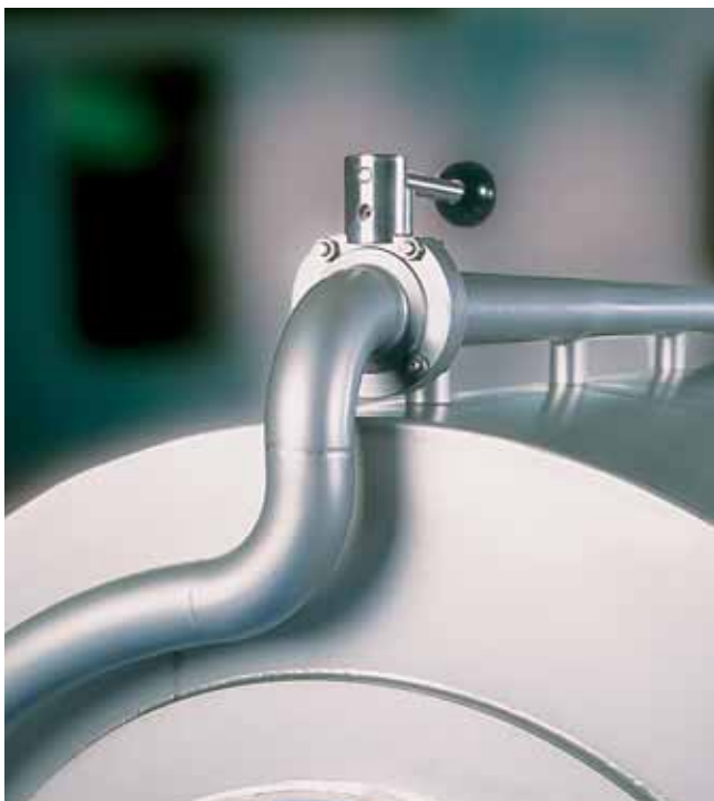
Foodec 800 with bar for CIP

Customers can also integrate Foodec decenter centrifuges into their existing system using external bus options available from several major manufacturers.