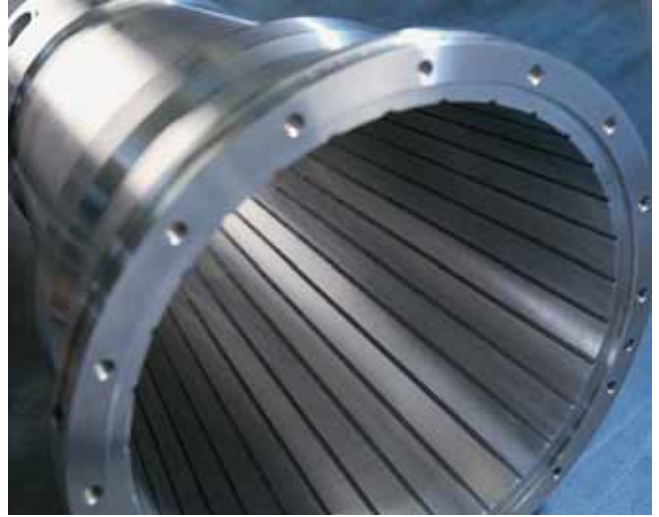
Grooves in the decanter bowl

ATEX-compliant decanters are available for zone 1, 2 and 22.