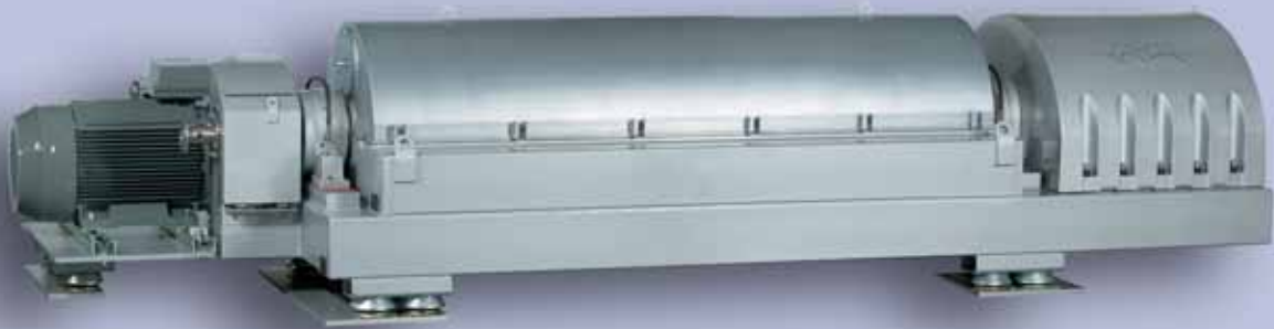
Foodec 800 decanter centrifuge