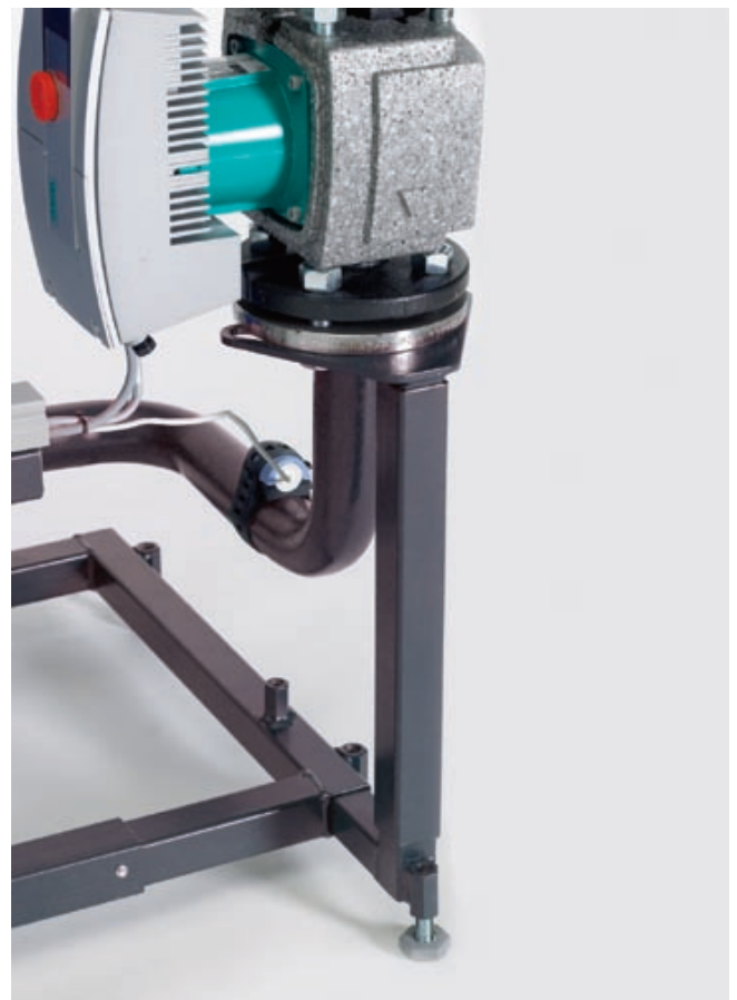
Adjustable feet aid installation.