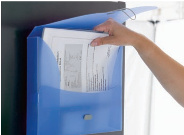
All documents, e.g. instructions, are placed in a box located behind the electrical panel.