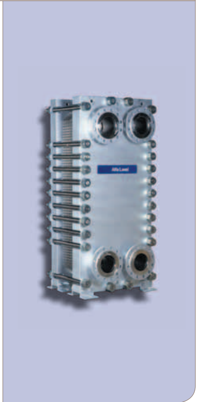
AlfaRex TM20 - All welded Plate Heat Exchanger

The construction only utilizes welding in the plane of the plate i.e. in two directions thereby avoiding welds in a third direction. This design ensures retained flexibility of the plate pack allowing for thermal and hydraulic expansions and contractions which will reduce the risk for fatigue cracks.