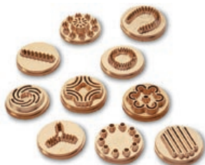
Italian cookie dies