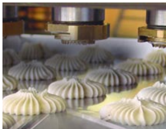
Italian cookie deposits