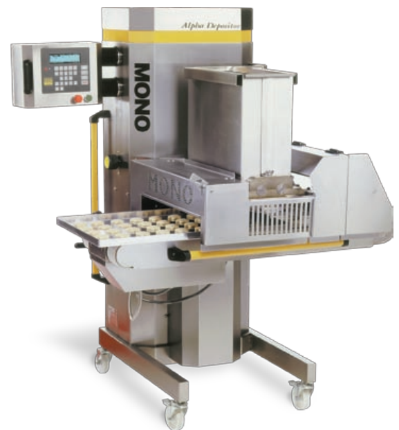
Alpha depositor with wirecut option