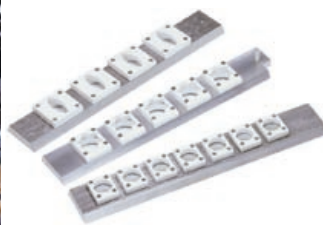
Many wirecut templates available