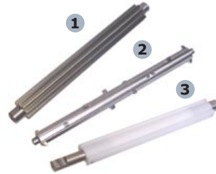
Gears: 1-Standard 2-Intermediate 3-Particulate