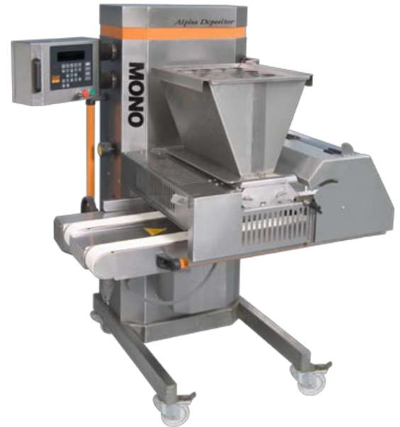
Standard Alpha depositor