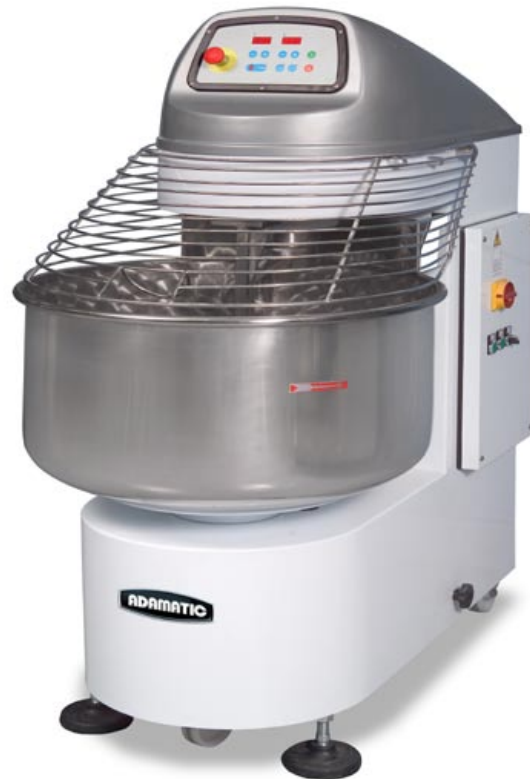
Model: ANSE-F-200 (with optional s/s exterior)