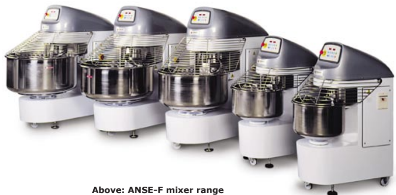
Above: ANSE-F mixer range

ADAMATIC • Division of Belshaw-Adamatic Bakery Group • 814 44th St NW, Suite 103, Auburn WA 98001 Phone: 732-544-8400 | 800-526-2807 Fax: 732-544-0735 • info@adamatic.com • www.adamatic.com